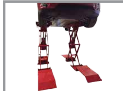
▲ Retractable Pull Decks 82.7" / 2100mm