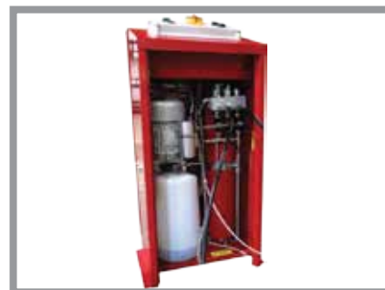
▲ Volumetric Control