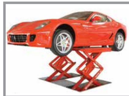
▲ Flush or Surface Mounted