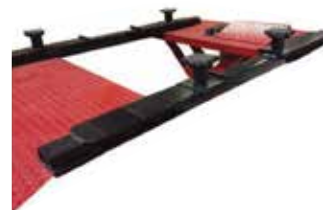
Adjustable frame engaging truck adapter

Архангельск (8182)63-90-72 Астана (7172)727-132 Астрахань (8512)99-46-04 Барнаул (3852)73-04-60 Белгород (4722)40-23-64 Брянск (4832)59-03-52 Владивосток (423)249-28-31 Волгоград (844)278-03-48 Вологда (8172)26-41-59 Воронеж (473)204-51-73 Екатеринбург (343)384-55-89 Иваново (4932)77-34-06