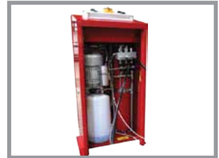
▲ Volumetric Control