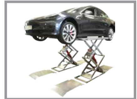
▲ Extended Ramps for low clearance vehicles and Hot-Dip Galvanization as optional accessories