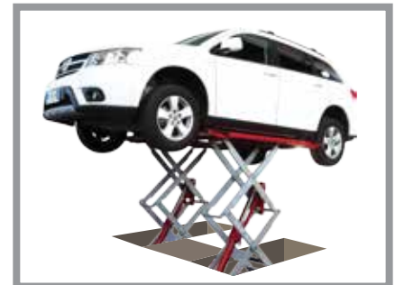
▲ Flush or Surface Mounted