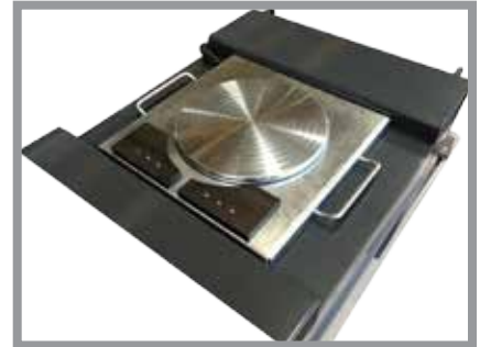
▲ Air Operated or Stainless Steel Alignment Turning Plates