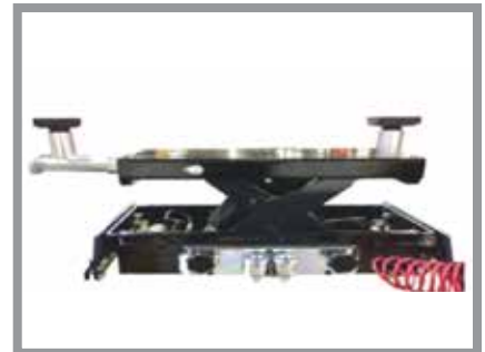
▲ Rolling Jacks